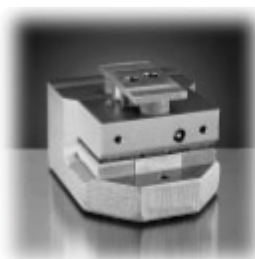
Edge Notching Units

"B" Units also offer you a wide range of standard holder widths and throat depths with round or shaped Punches and Dies. Strong stripping springs and rugged holders insure uniform holes. Units feature quick-change Die Block retention and easy die removal.