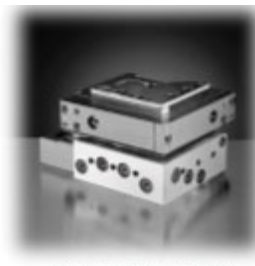
Corner Notching Units

B Series Punching and Notching Units are designed for press equipment with limited Die space. Round and shaped holes are available up to 3 1/2" in diameter.