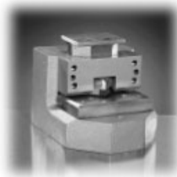
Vee Notching Units

Notching Units for mild steel up to 10 ga. thick