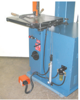
Air power feed