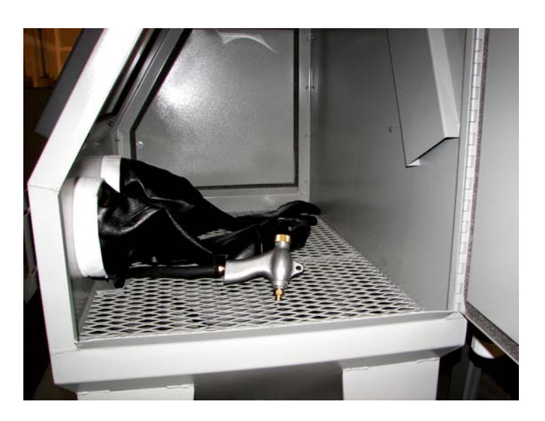
Floor Space Required (both S and DH)

Light weight, flexible and abrasive resistant.