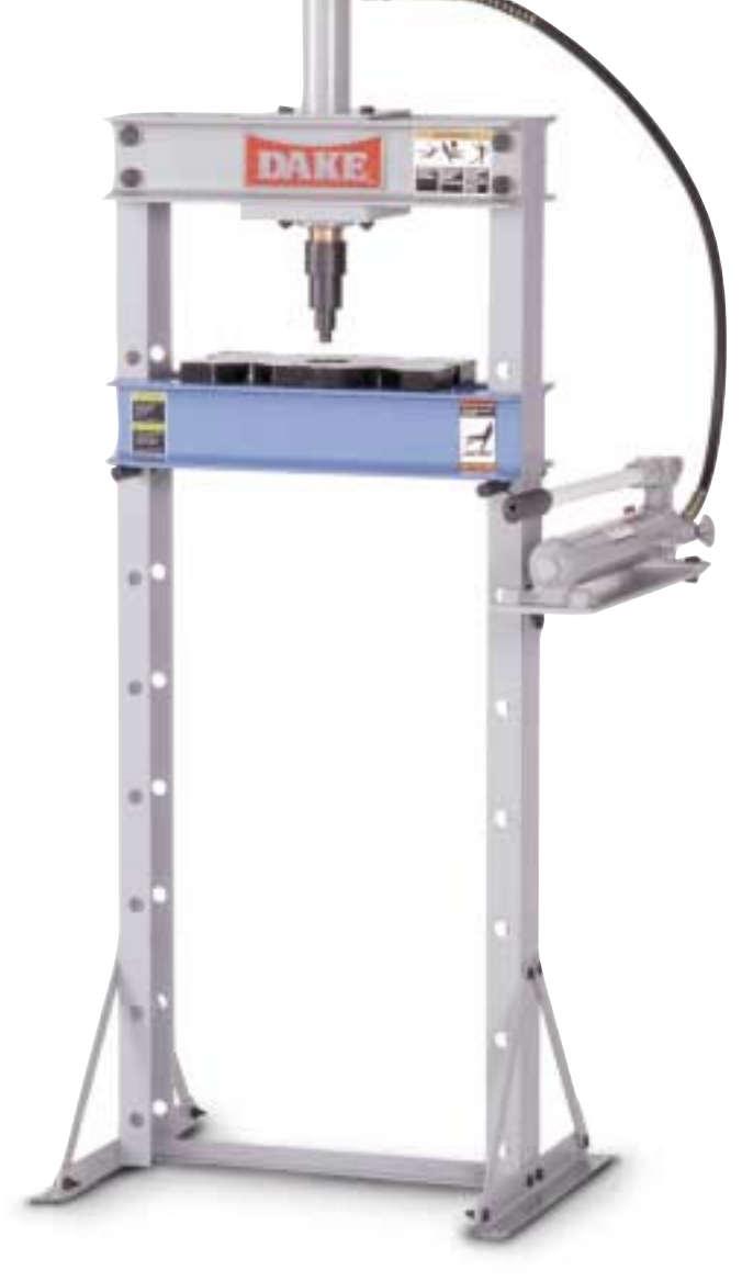
Table can be adjusted for maximum or minimum vertical opening to accommodate a variety of work pieces and to minimize required ram travel.