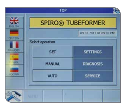
State-of-the-art User Interface