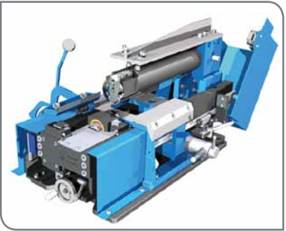
High Performance Super Slitter