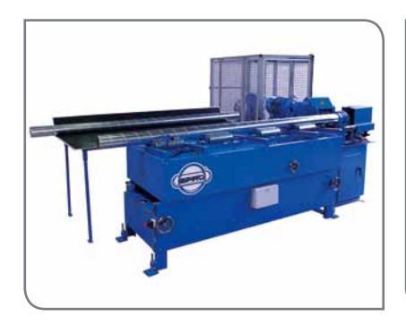
Automatic Duct Receiving System