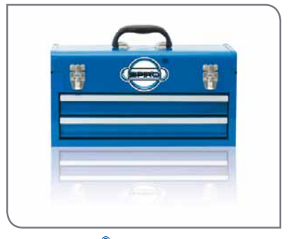
The Spiro<sup>®</sup> Service Package