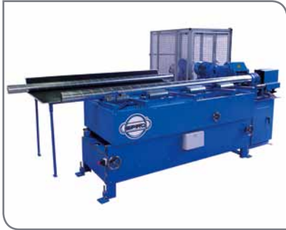
Automatic Duct Receiving System