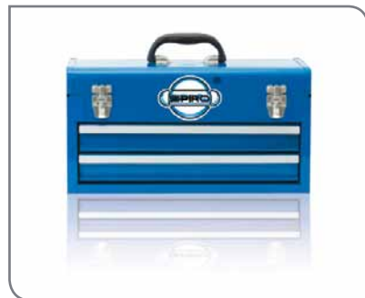
The Spiro® Service Package