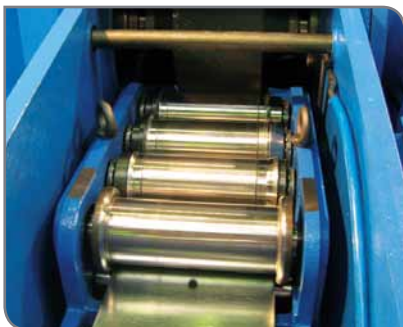
Narrow Lockseam Solution