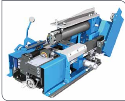
High Performance Super Slitter