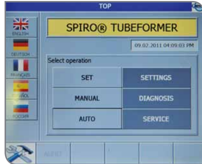
State-of-the-art User Interface