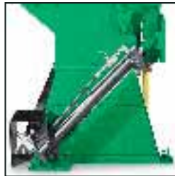
Optional hydraulic-powered assist.

Optional features include: extension fingers which allow forming inside corners with a return flange across the top of the boxes; open end fingers which provide for triangular, square, tapered and rectangular tube-forming capabilities. The power assist option is a factory-installed-only, hydraulic-powered, lower-bending leaf.