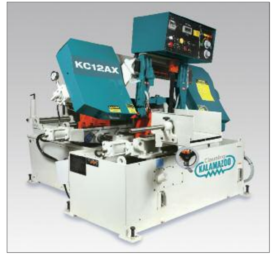
Shown with optional Hydraulic Bundle Clamp and Variable Vise Pressure System