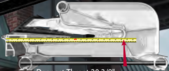
Deepest Throat 20 3/8"

Contact SCOTT MACHINERY - PH#916-638-7718 sales@scottmachinery.com