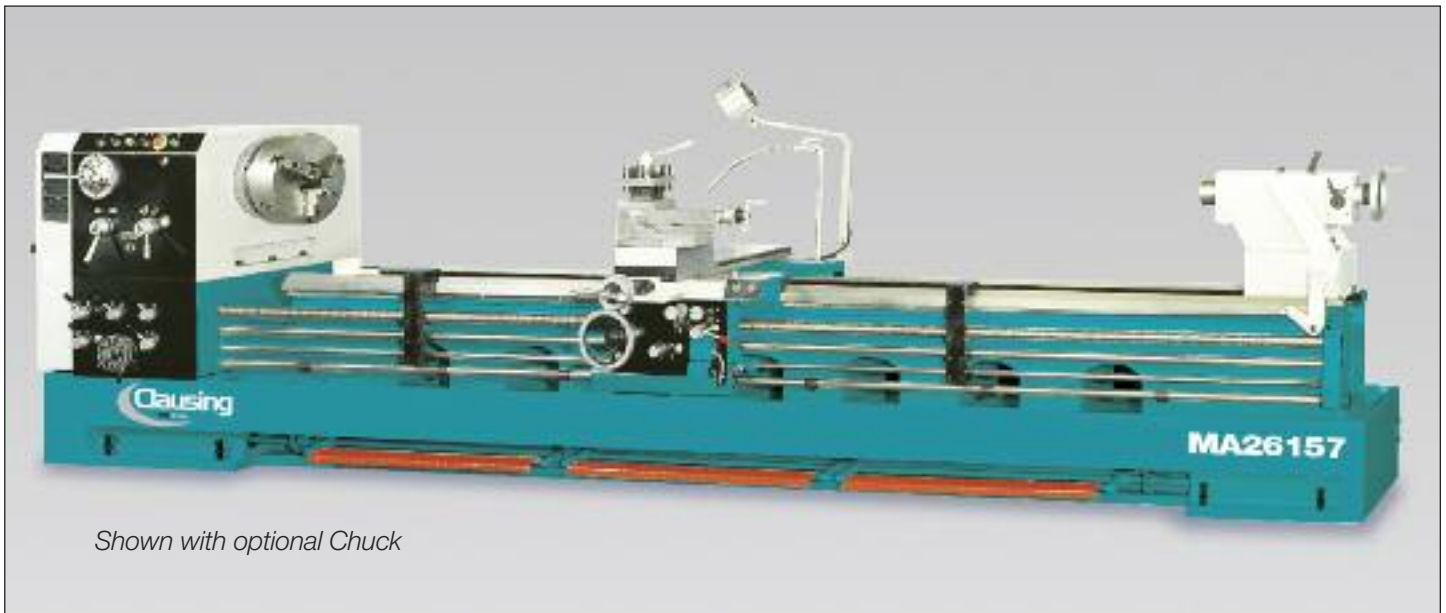
Shown with optional Chuck

The Clausing MA series large swing geared head engine lathes are engineered to allow the accurate and efficient machining of large components. A wide range of optional accessories make these machines suitable for most industrial applications, including job shops, oil field, power utilities and ship building.