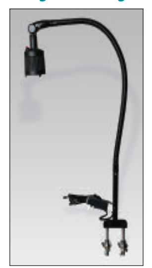
Part No. FV-9070G