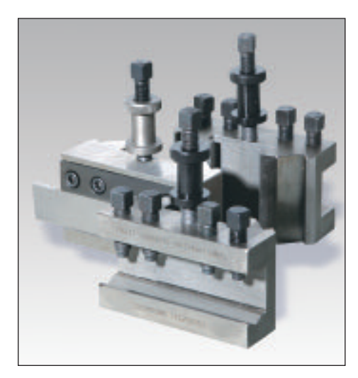
Tool Holder Top Slide and Rear Quick Change Block