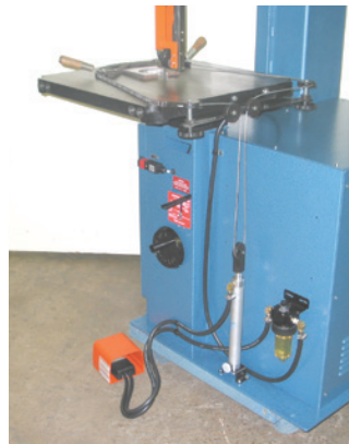
Air power feed