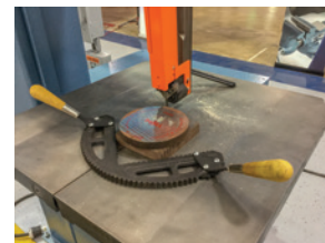
Work holding jaw with handles