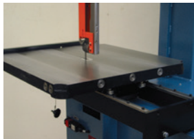
Extended traverse work table