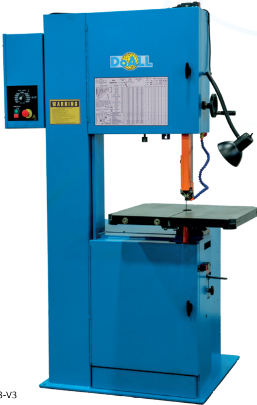
DoALL 2013-V3 Vertical Contour Saw – 20 x 13" Rectangular Capacity and 13" Round Capacity