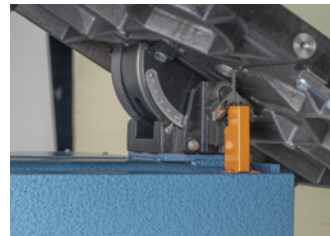
Table tilt angle gauge