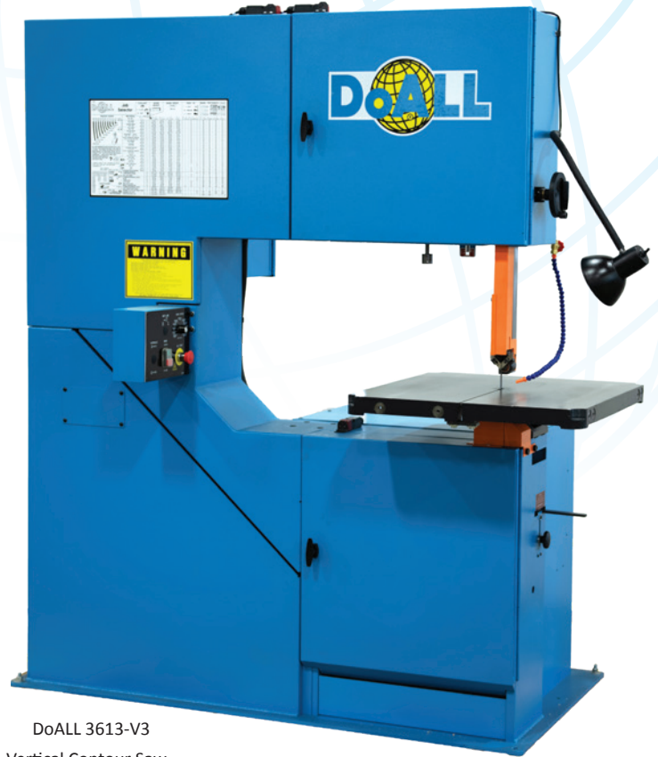
DoALL 3613-V3 Vertical Contour Saw – 36 x 13" Rectangular Capacity and 13" Round Capacity

Among the most versatile metal cutting machine tools available, DoALL Vertical Contour metal cutting band saws can cut aluminum, brass, copper, mild steel, tough tool steel, stainless steel and sheet metal, as well as non-metals like plastics and fibrous materials. DoALL metal cutting, upright band saws are available in sizes to fit your needs and feature band speeds that permit contouring, cut-off and machining of almost any material.