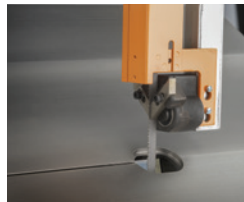
Upper saw guide block